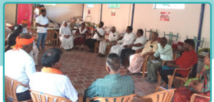
SMILE Organized interfaith leaders meet at SMILE Center.