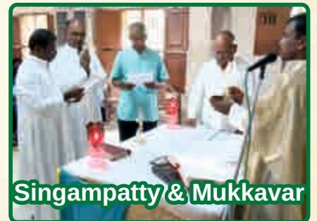
Singampatty & Mukkavar