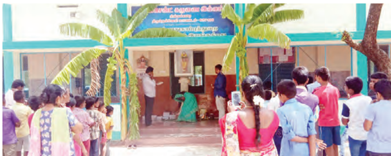
October 07; We celebrated Sarasvathi Pooja in our Home for Children.