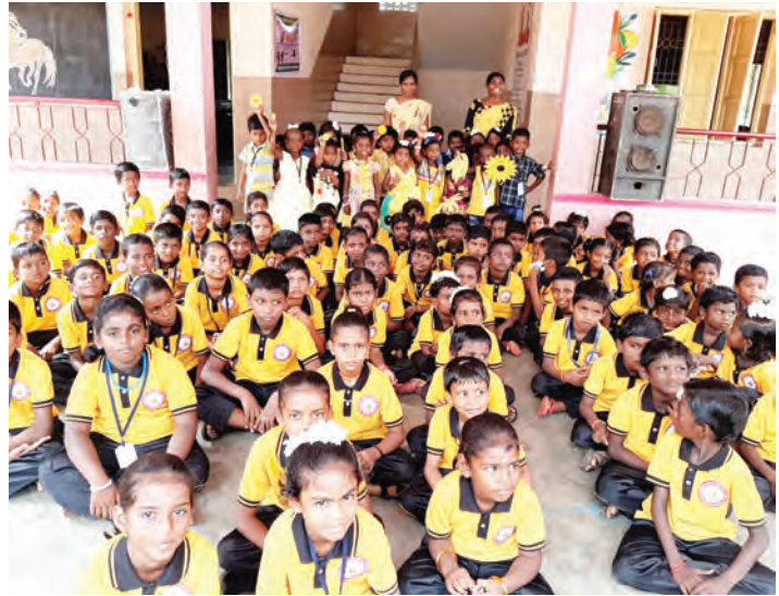
October 10; Yellow day was observed at Christhu Jyothi Primary School by the children.