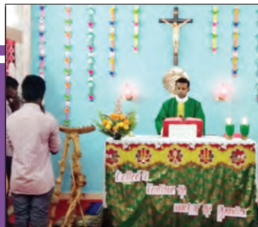
October 16; A special Holy Mass was offered for vocation at Kanthalore House.