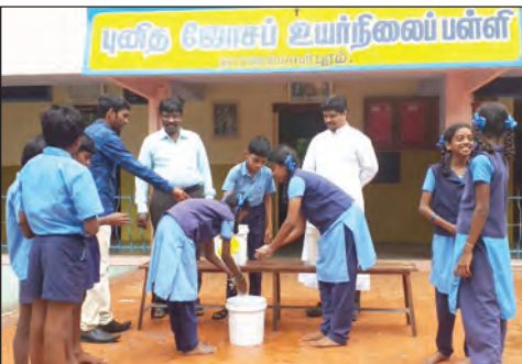
October 15; Global Hand washing Day was celebrated at our school.