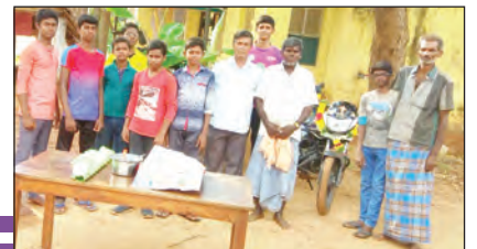
October 07; We celebrated Ayutha Pooja and Sarasvathi Pooja in our Agricultural farm. Our Province candidacy students also took part in the celebration.