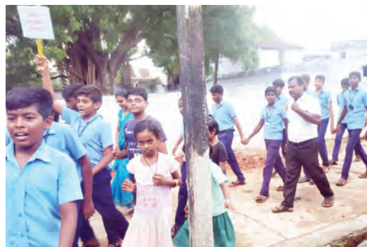
October 19; We had a rally program on behalf of peace club to insist greening environment at Keela Eranamalpuram. our High school students performed cultural events to create awareness among the people.