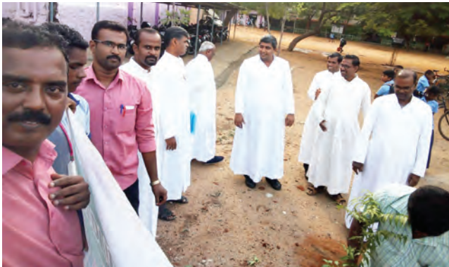
October 17; Bro. Provincial Superior made his Canonical Visitation with his team and the education commission members visited our School.