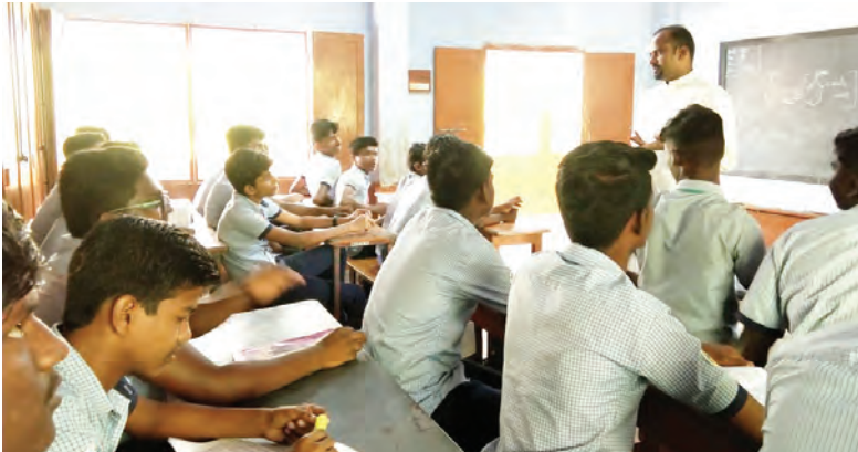
October 11; Vocation Day Celebration was held at Christhu Raja Hr. Sec. School.