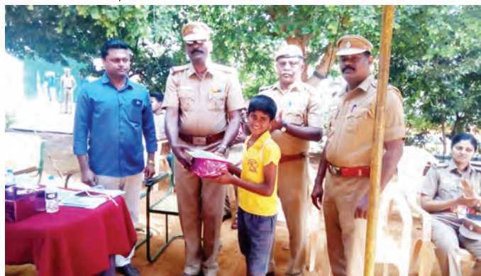
October 19; Police training academy, Manimuthar conducted a Marathon race in which our High school students took part and they secured first and second places.