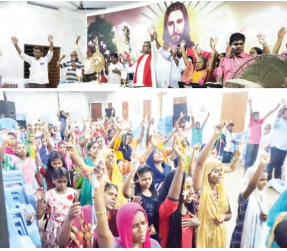
October 08; Arputha Yorthan Retreat Centre organized a Jebamalai Retreat from October 4 th to 8 th at the centre. Many devotees participated and benefited from it.