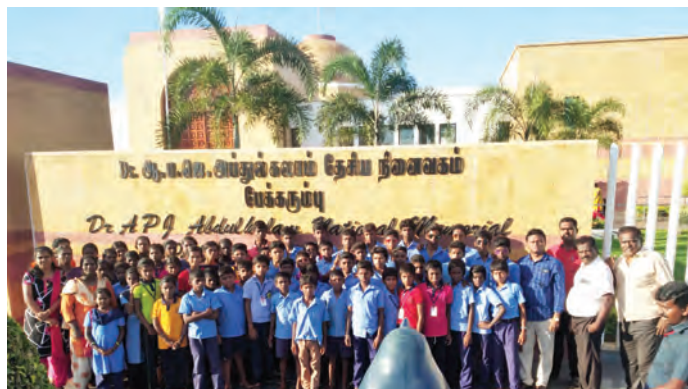
October, 14 & 15; We had two days of educational tour for the students of St. Michael's High school. We visited Trichy Malakottai, Kallanai, Poondi, Tanjur Temple, Velankanni, Oriur, and Rameshvaram.