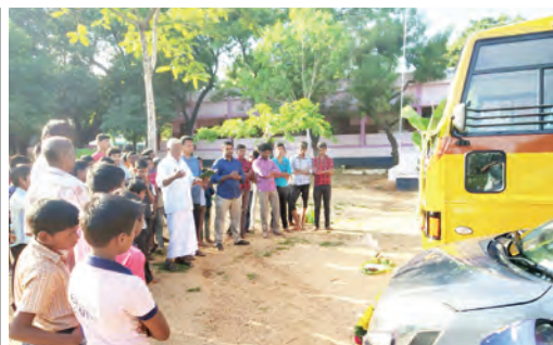
October 07; We celebrated Ayutha Pooja in our High School.