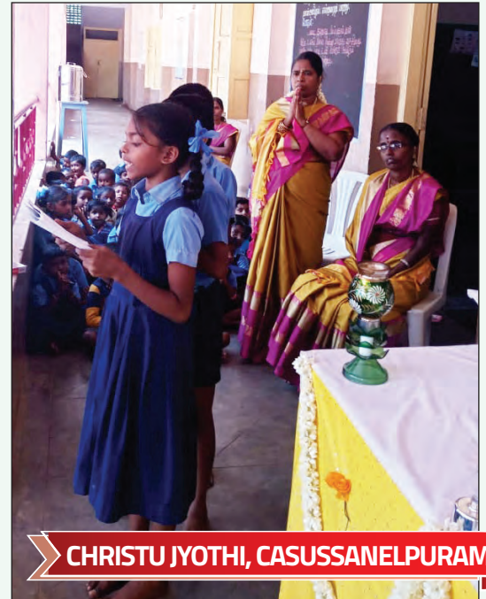
CHRISTU JYOTHI, CASUSSANELPURAM