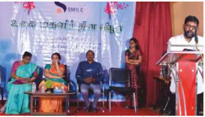
On 10<sup>th</sup> March 2024, the International Women's Day celebration was a resounding success by SMILE at St. Mary's Home for Destitute Children campus. Women from the SMILE Tailoring Institute and women's self-help groups came together and enthusiastically participated in the occasion, spreading joy and empowerment. Women successors were awarded and honoured for their hard work.